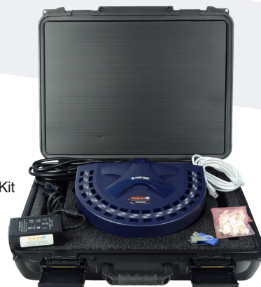
°C Port3600 Kit

Note: AccuTrac™ software downloadable on www.degrec.com