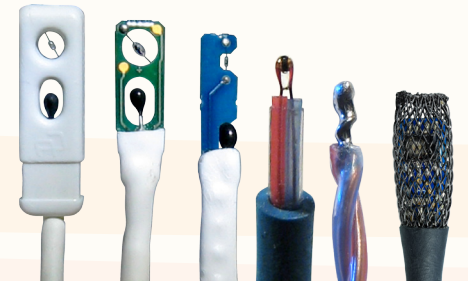
UAS1000 = Air Velocity & Air Temperature UAS2000 = Microflow Air Velocity & Temperature UTS1000 = Surface Temperature UHS1000 = Humidity